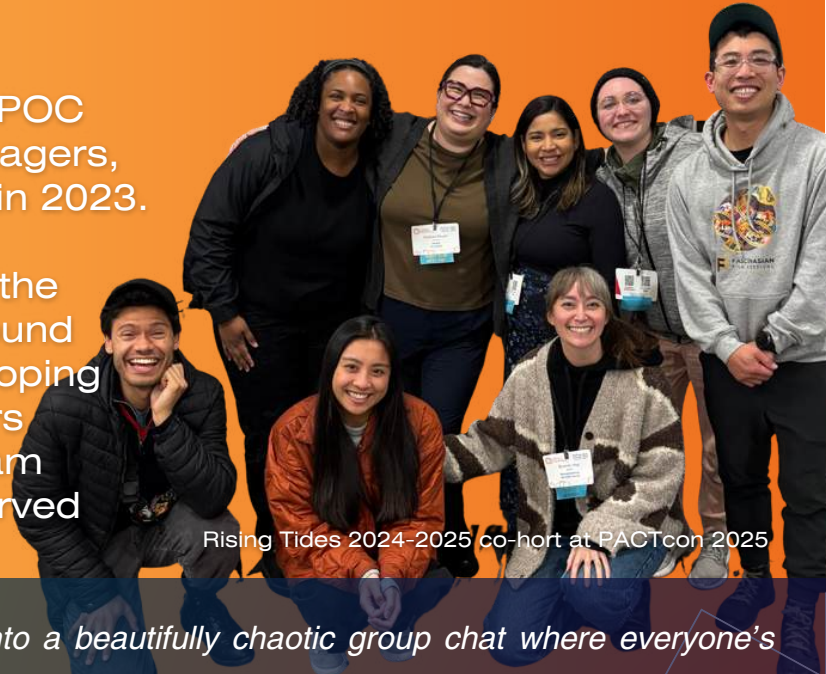
Rising Tides 2024-2025 co-hort at PACTcon 2025

The initiative intended to fill a gap in the Canadian performing arts sector around the training and mentorship of developing and mid-career IBPOC administrators and managers by providing a program specific to the needs of this underserved community.