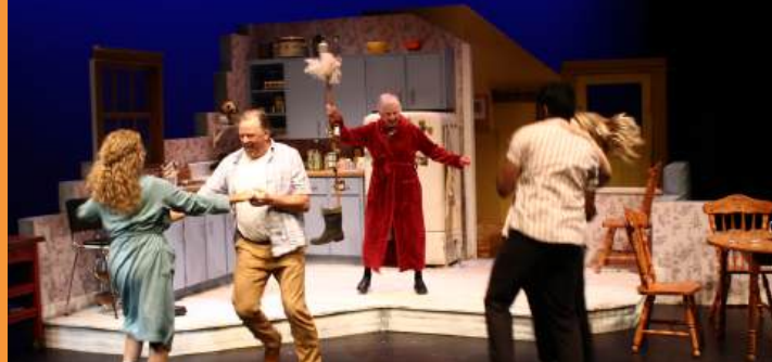
MT Space & Page 1 Theatre, There are no Gays in Chechnya , photo by Andy Wright, 2023