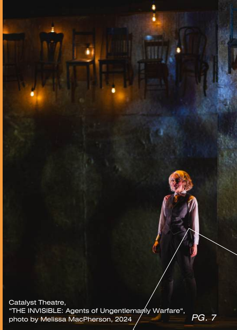
Catalyst Theatre, "THE INVISIBLE: Agents of Ungentlemanly Warfare", photo by Melissa MacPherson, 2024