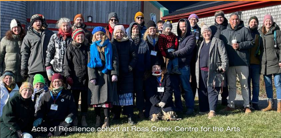
Acts of Resilience cohort at Ross Creek Centre for the Arts