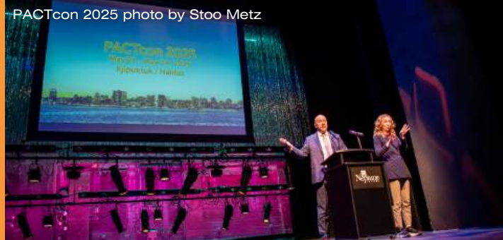
The Foster Festival, Time & Tide , photo by Emily Oriold, 2024