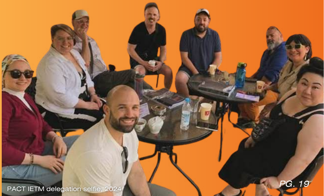
PACT IETM delegation selfie, 2024

Thanks to funding from the Canada Council for the Arts' Arts Abroad grant, we were able to bring a delegation from The MT Space, Theatre Passe Muraille, Boca del Lupo, Tapestry Opera, Prairie Theatre Exchange, 2b theatre, Geordie Theatre, Savage Society and Catalyst Theatre!